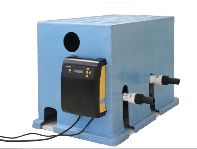
Pipework fittings a cover included