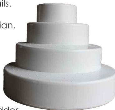
Optional Pool Steps for Clipper Pool

Drain & Ball Valve | Skimmer box & Fish Eye | Pump Sand Filter | Pump cover | Chlorine tablets Leaf Scoop | Broom | Test kit | Thermometer | CPR Sign Pipework | Stainless Steel Deck Ladder or A-Frame Ladder Optional Pebble Look for Tug Pool | Optional Pool Steps for Clipper Pool