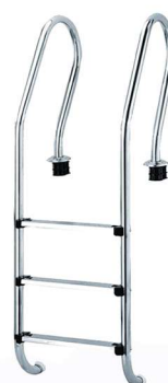
Stainless Steel Deck Ladder