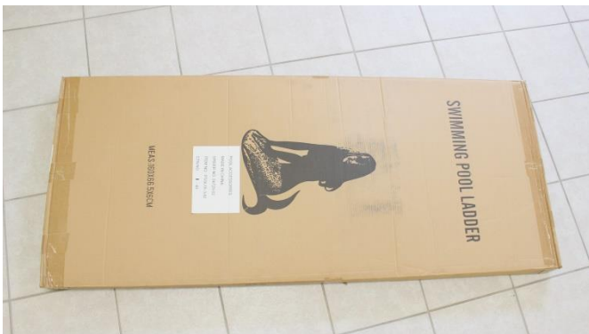
Open The Box Containing Your Poly Pool Ladder