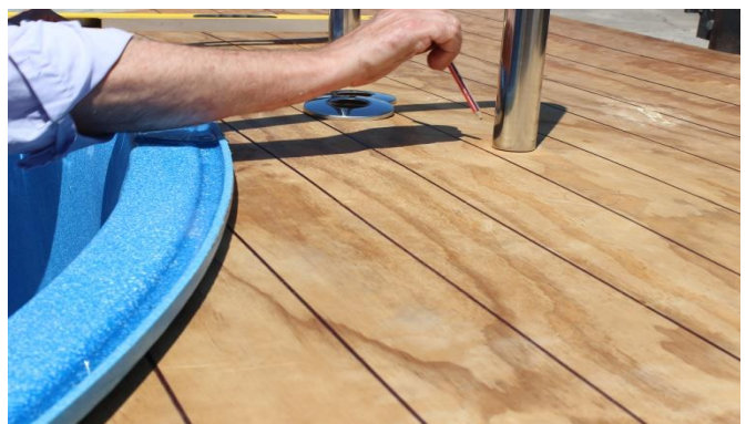
Mark on your deck where you want the ladder rails to sit