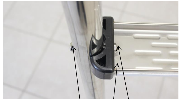
Washer Nut Step Underside