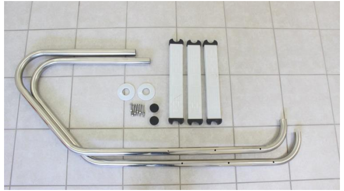
Gather together remaining components.