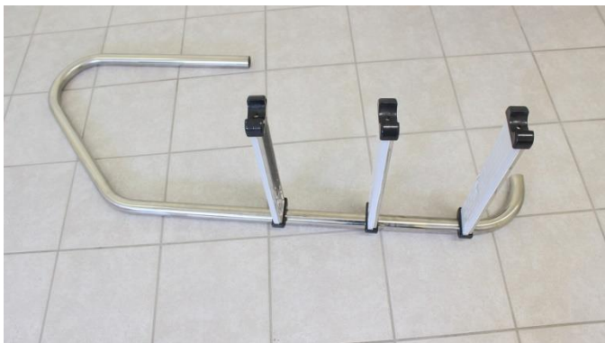
Do this for all three steps. step