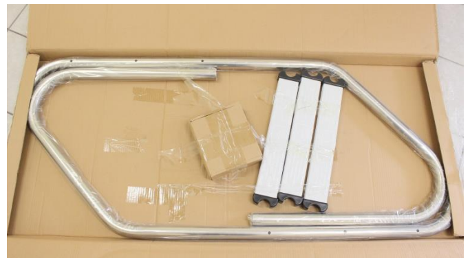
Ensure box contains all components including: