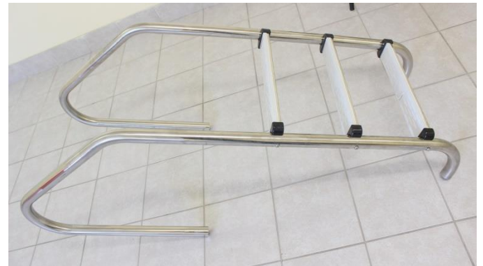
Do the same attachments process for each on the other side.