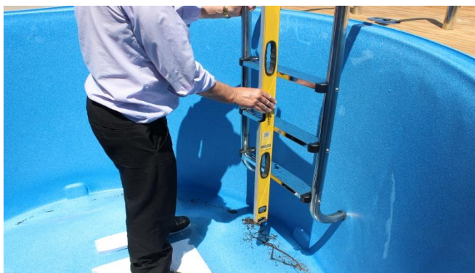
Place ladder in pool and on deck. Ensure Steps are plumb with a spirit level