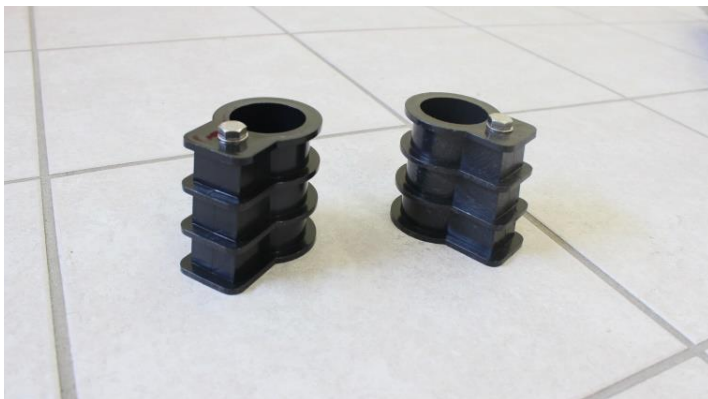
Open the smaller box and discard the 'foot pockets' for non-cement surround installation