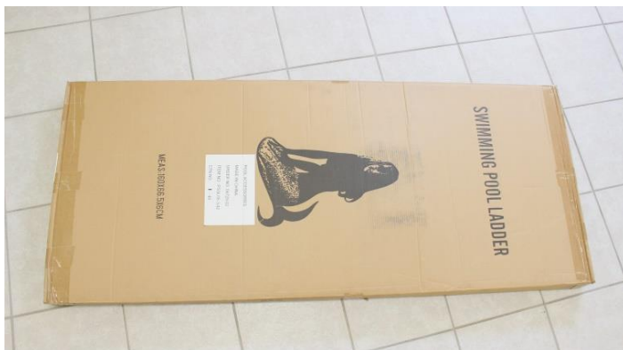
Open the Box Containing Your Deck Ladder

Your Ladder box will contain; two step rails, 3 steps, and a smaller box containing two plastic 'foot pockets', 2 Aluminium blocks, 2 screws, 2 rubber ends, 6 nuts, 6 washers and 6 bolts and 2 Aluminium disks.